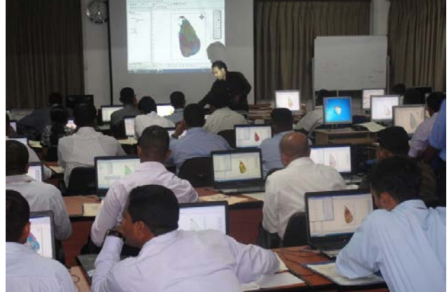
Participants of the 39<sup>th</sup> Short Course (7<sup>th</sup> to 12<sup>th</sup> November) at a technical session