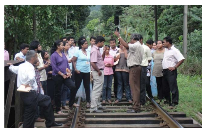
Participants of the 37<sup>th</sup> Short Course (13<sup>th</sup> to 18<sup>th</sup> June) at a field class