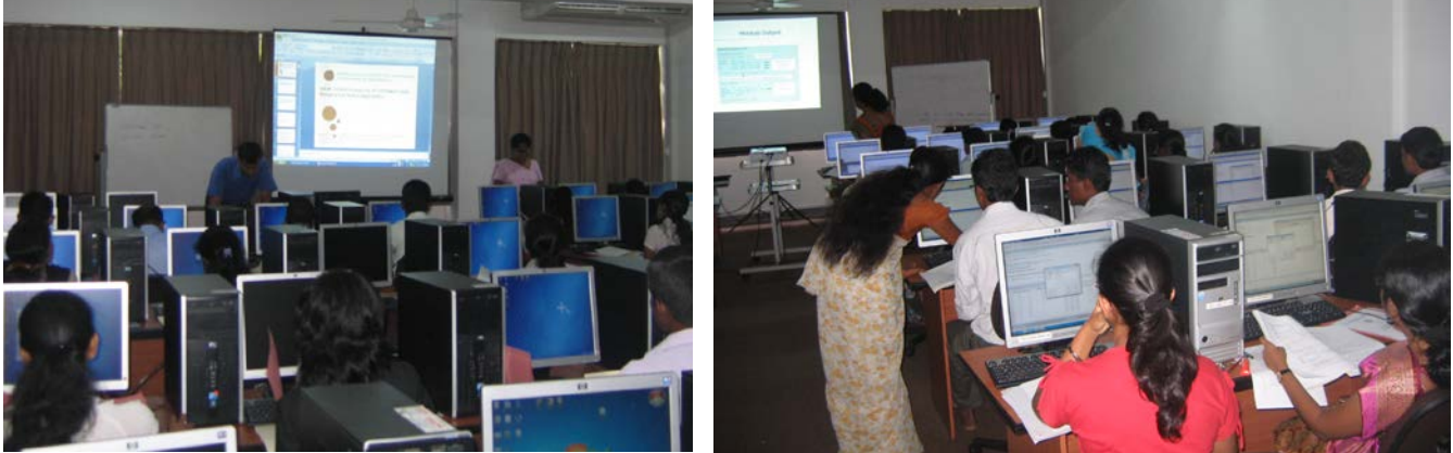
Technical sessions of the Short Courses on Analysis of Experimental Data held at the Computer Unit of the PGIS

SHORT COURSES ON ANALYSIS OF EXPERIMENTAL DATA