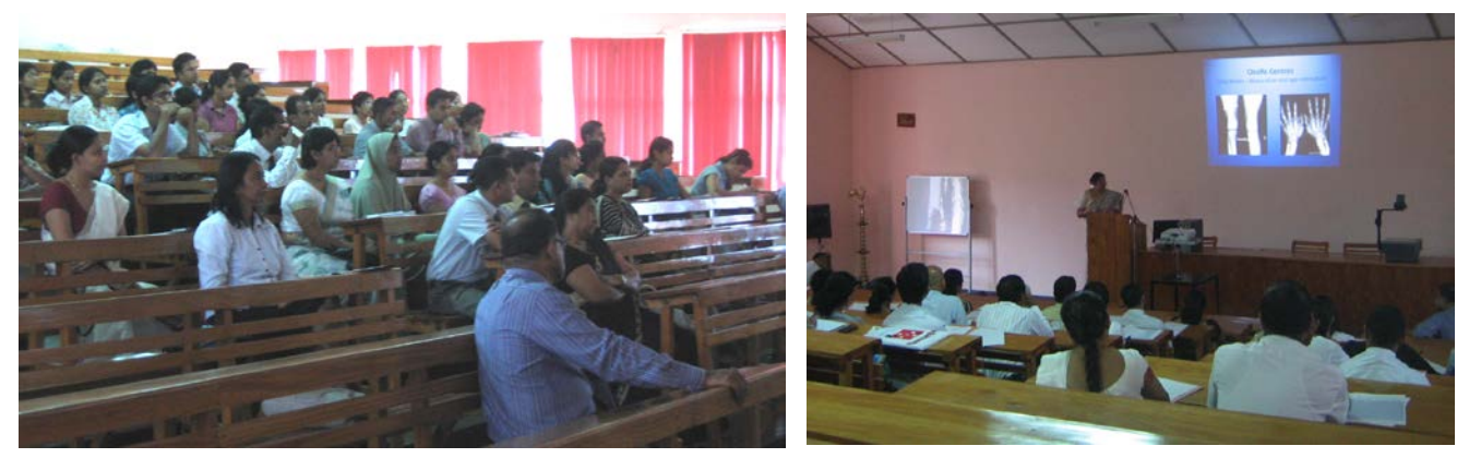
Participants at a technical session of the workshop

WORKSHOP ON HUMAN GROWTH AND MATURATION - CLINICAL APPLICATIONS