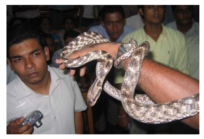
Participants taking a close look at a snake during the practical session on Identification of Snakes.