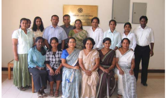
Left: A workshop session. Right: A group photograph of participants and resource persons