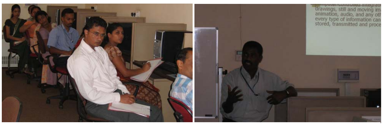
A technical session in the PGIS computer laboratory.