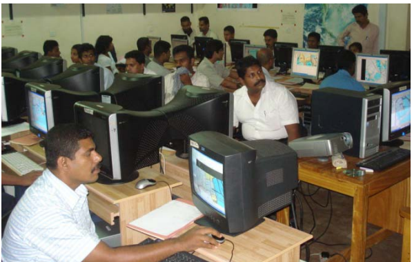
Left - Field sessions on GPS. Right - A practical session in the GIS and RS laboratory of the PGIS